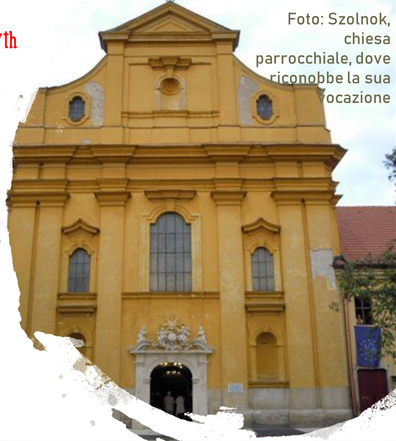
Foto: Szolnok, chiesa parrocchiale, dove riconobbe la sua vocazione